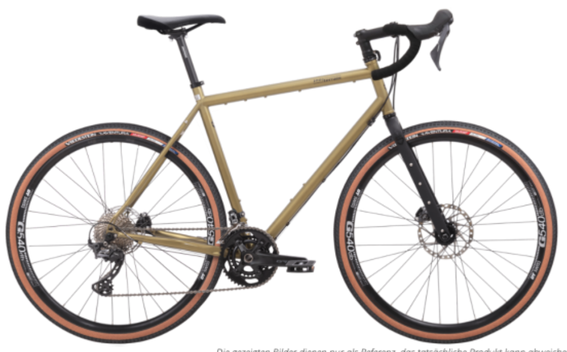
Die gezeigten Bilder dienen nur als Referenz, das tatsächliche Produkt kann abweichen. Pictures shown are for illustration purpose only. Actual product may vary.